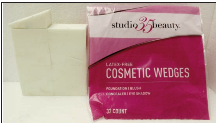
White sponges from the health/beauty/cosmetics sections of drug, dollar, and food stores.

Each of my favorite blends has its own dedi-