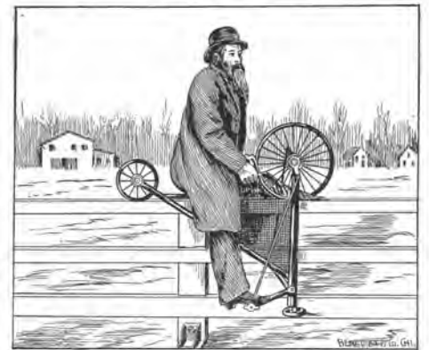
The accompanying drawing shows the idea

of the new form of rapid transit, wherein each man is to run his own train and (if the report is true that he can run it at 40 miles an hour) trust in Providence to protect him against rear end collisions or breakage in the track.