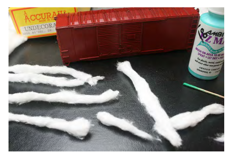
Above: Materials needed: Ambroid EZ Mask and cotton balls cut into very thin strips