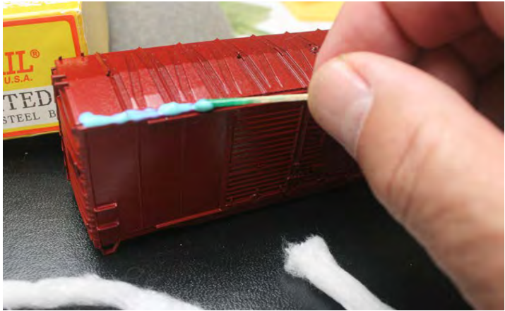
Above: Using a Q-Tip or similar, apply the EZ Mask along the edge of the roof line.