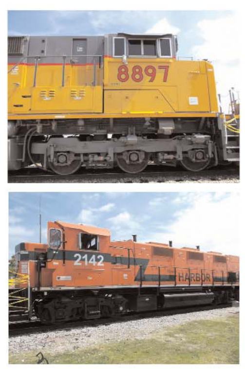
At Railroad Daze in June, a UP SD70AII and an IHB Genset switcher were two locos you could view and tour.