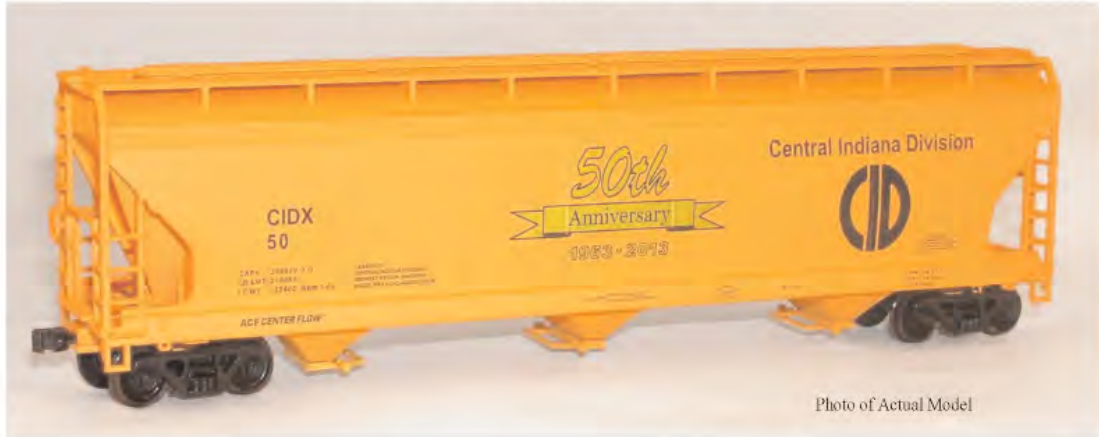
Photo of Actual Model