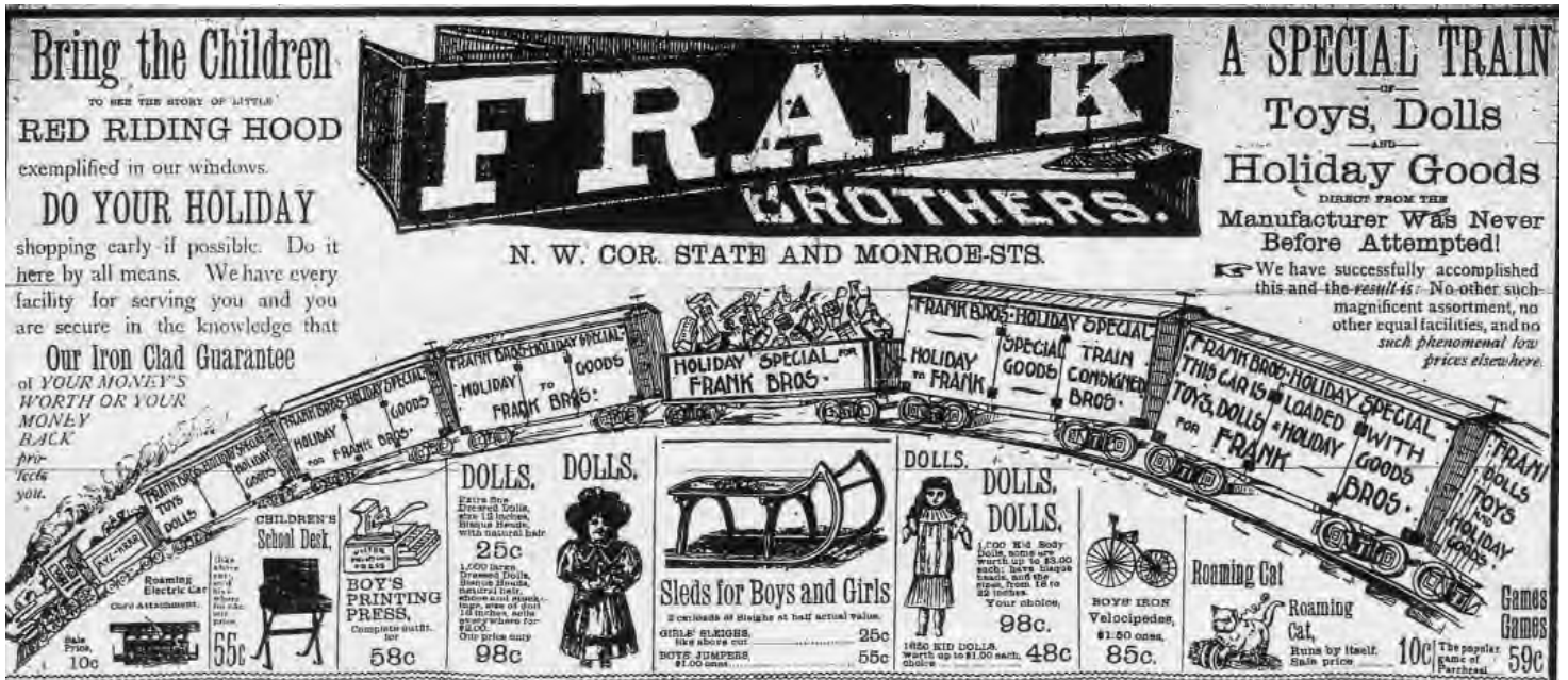
Chicago Times ad from 1897