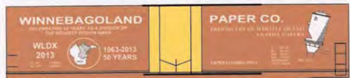
ABOVE: PRE-PRODUCTION RENDERING OF CAR. BELOW: ACTUAL KIT

PRODUCED BY THE WINNEBAGOLAND DIVISION OF THE NMRA