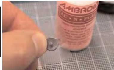
above: applying glue to a hatch right: hatch with film glued in place, awaiting trimming Below: Clamp to hold it while the glue dries

To model the sheets I needed a semi-transparent plastic that was thin yet slightly inflexible, not limp and clingy like kitchen plastic wrap. And, of course, I did not want