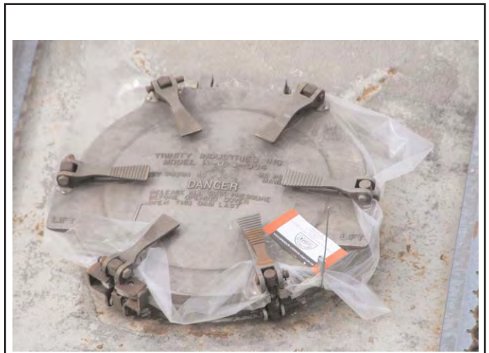
Several of photos of prototype hatches showing the plastic film.

This issue's project deals with an often-ignored bit of freight car detail. At the BNSF yard in Galesburg IL this June I noticed that about one out of every 30 or so covered hoppers have hatches that are sealed with a plastic sheet, making the hatches more watertight and dirt-proof, and protecting the powder, chemical, food, or plastic pellet loads from contamination. The prototype photos show the plastic sheeting on a trough hatch, as well as the more-common round hatches. A U.S. Department of Agriculture website dealing with fumigation of bulk grain and rice in transit calls for the following: "Spray the opening of trough type hopper cars with a sticky adhesive and place a plastic film (not less than 4 mil. thickness) over the opening when fumigating in transit. The plastic film is not required for hatch type hopper cars provided the gaskets on the covers are intact." Another website on unloading polymer resins calls for venting the hatches by removing any plastic film beneath the hatch cover. I conclude that plastic film is used for many commodities. I do not know when this began.