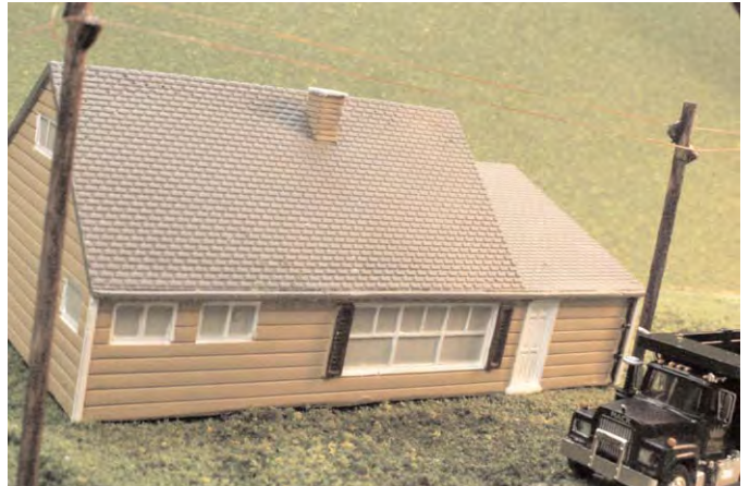
This is the photo I forgot to include last time. I hope I did not offend too many "N" scalers. The editor.

Things got confused in the prior column about Forster Mini-Sticks and Loew Cornell's "Woodsies" Mini Dowels. The inch symbol ("") sometimes became the foot symbol (') for the scale dimensions, plus a photo was accidentally left out. The Mini-Sticks in HO are 7 inches by 7 inches by 19 feet. In N they are 1 foot by 1 foot by 35 feet. In O they are 3 inches by 3 inches by 10.5 feet. For the Mini Dowels, in HO they are 6.5 inch diameter by 18.5 feet; in N they are 11 inches in diameter and 34 feet long; in O they are 1 1/2 inches in diameter and 10.25 feet long. The article had a photo that showed the Mini Dowels used as light utility poles in HO, but it also said a photo showed the Mini Dowels used as utility poles near an N scale truck and house to show the proportions. That photo went missing. I just shortened the length, so the bracket for the wires is oversized for N scale, but the Mini Dowels are actually well-proportioned N scale utility poles. N scale friends tell me they feel left out of many project-type articles so I particularly wanted that photo to appear. Here it is.