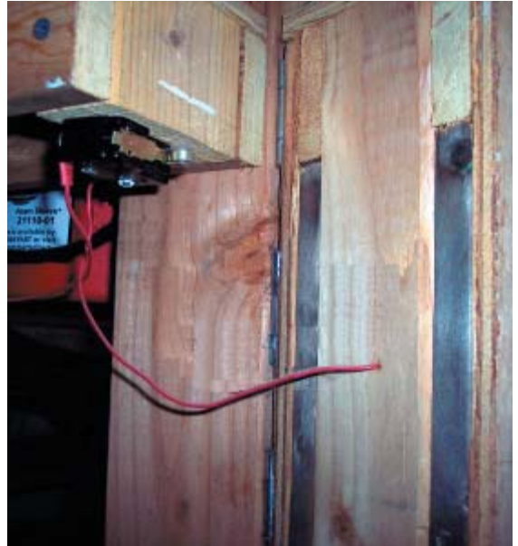
Figure A -micro switch at swing gate

Bill of Materials for each gate: -All metal cupboard door magnets (2) -Micro switches with rollers (1) -'L' metal brackets (1)