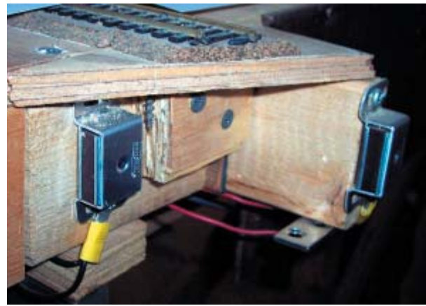
Figure C - Magnets (wired) + L bracket