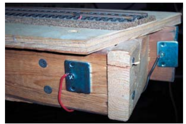
Figure B-Magnet Plates (wired)