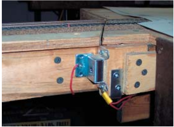
Safety Lead Track Swing Bridge area Safety Lead Track Magnet Plate