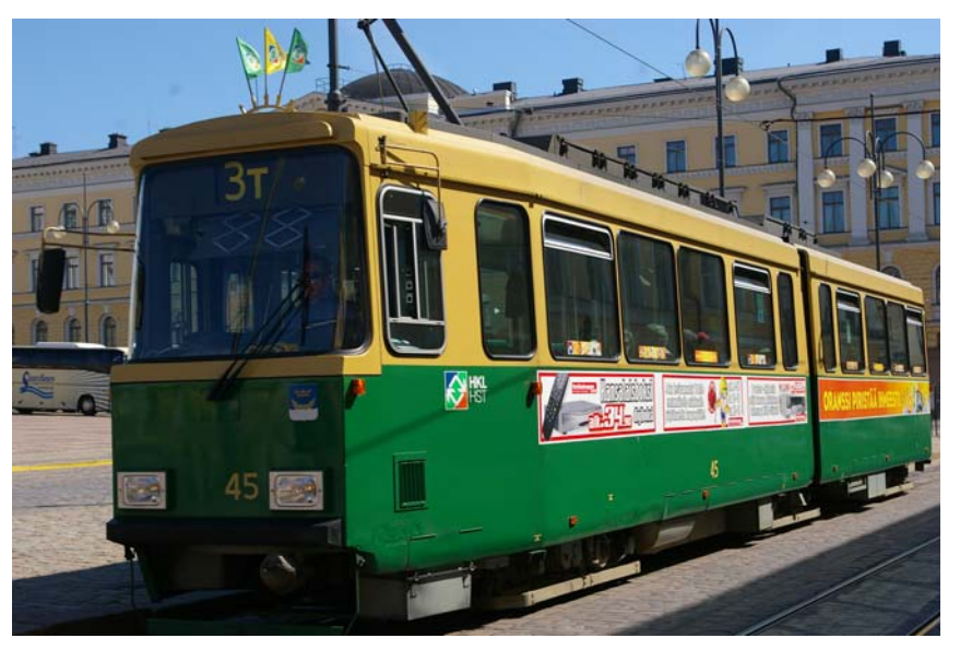
Helsinki Finland