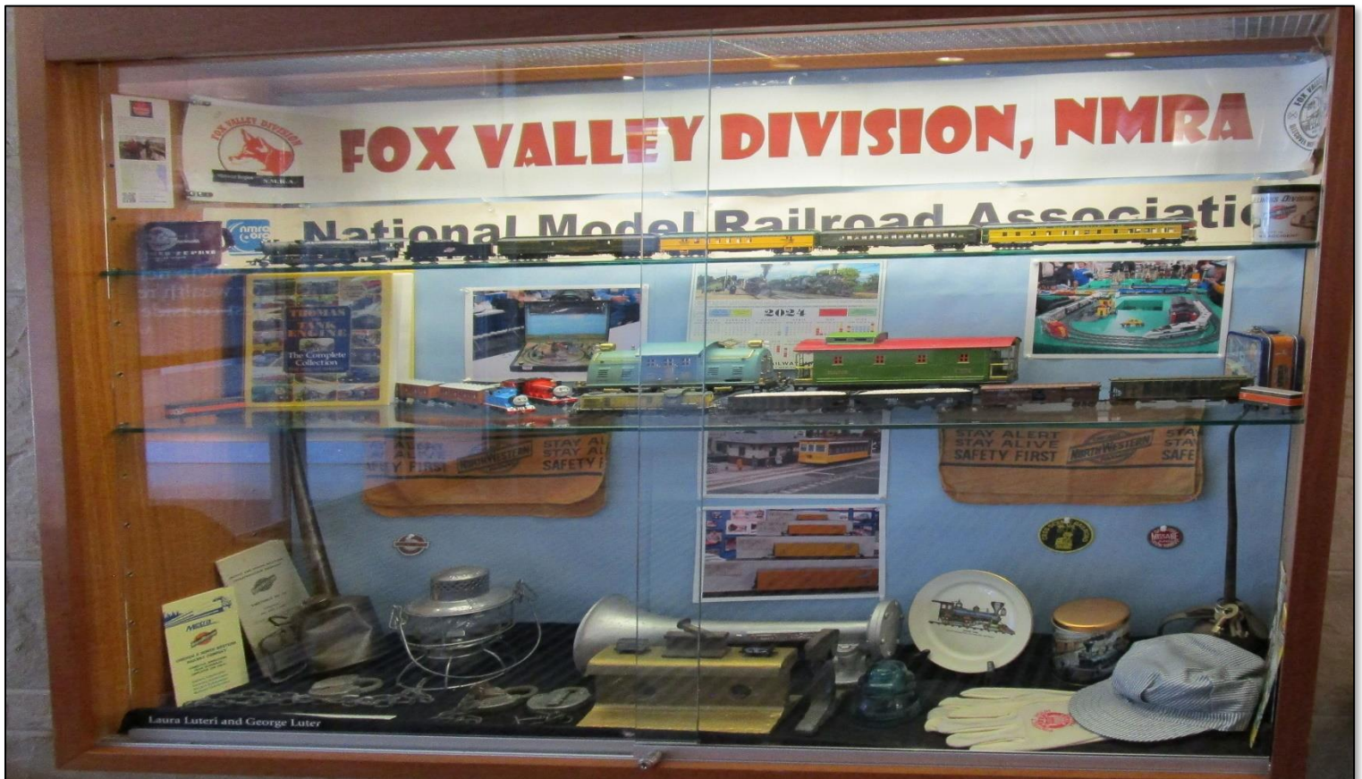
Above: January display at the Mount Prospect Public Library.