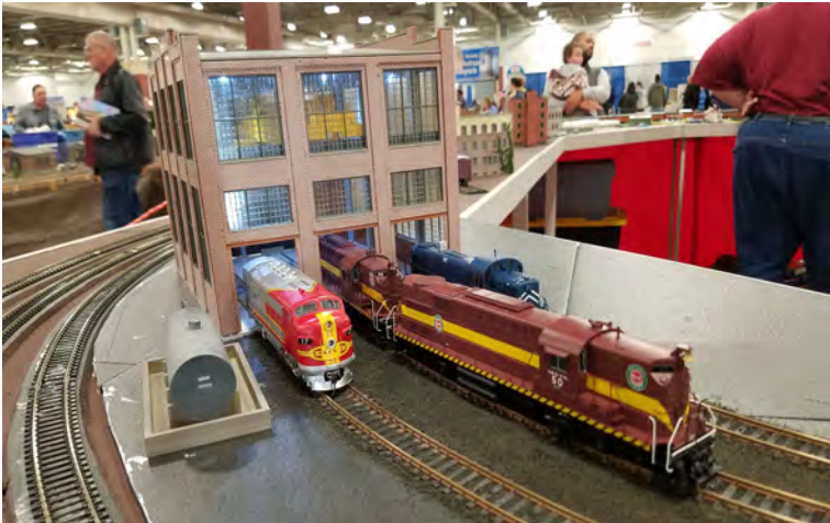
The "back" side of AHSOME's new layout includes a large classification/staging yard (top), and in a corner (bottom), the beginnings of a nice diesel house scene. In the background of the top photo is one of the special wood racks used for shipping the layout sections.