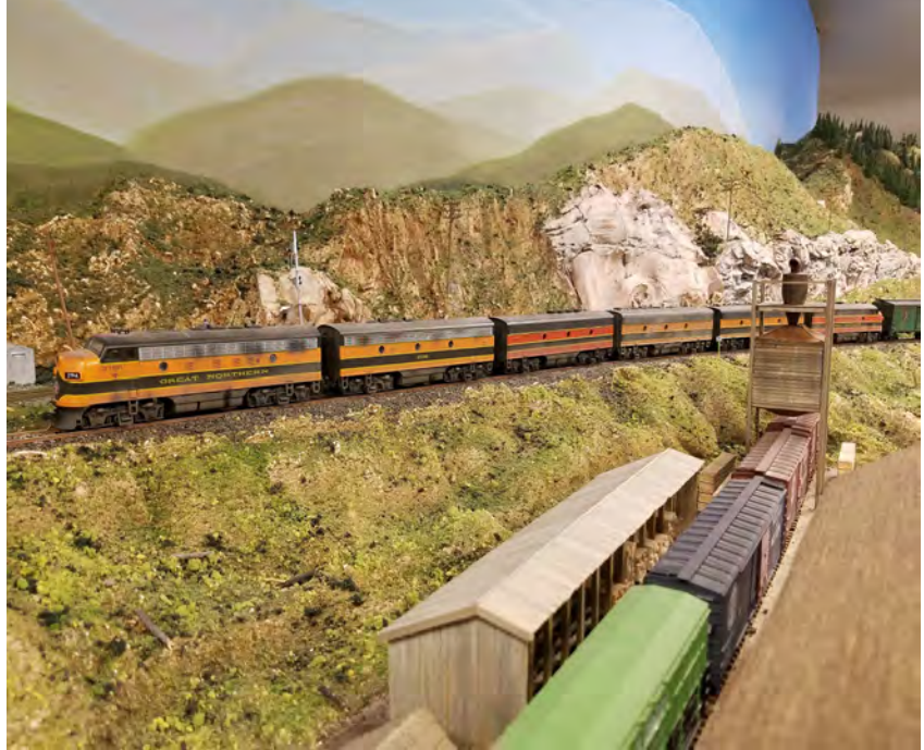
Top right, mixed GN blue, black and white, and orange and green power lead a freight across the tall Fish Creek Trestle near Cyr, Montana. In the center photo, the photographer couldn't resist taking a shot of a matched GN orange and green set of ABBBBA F units, waiting for a green board at Marshall. To the left is a CB&Q GP9 and caboose in local service sitting below the tall grain elevator at Montgomery, Illinois. The prototype for this elevator still stands on a BNSF double track main there today. Though the Great Northern and Northern Pacific railroads are the two primary roads on the GNP layout, the CB&Q also has significant trackage and importance.