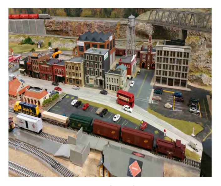
The Jackson Local pauses in front of the Jackson depot before beginning its switching assignments in town today on the KV&EC club's N scale layout in Huntley.

Through the years the N gaugers have included atypical scenery features on their layout including a large reservoir lake at the top of a mountain, a huge concrete dam, a couple of "highways to no where", and a mountain scene with lightning flashing from behind the mountain, loud thunder, and the wail of a