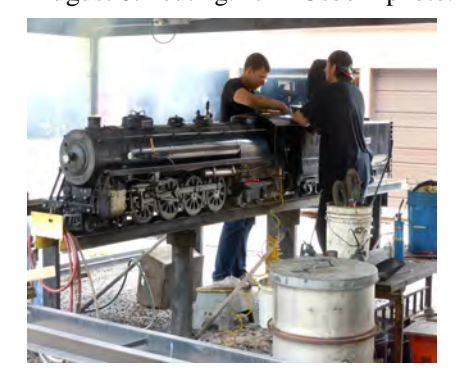
ILS crew members prep a big 4-8-4 steam engine for running. It took a good hour to fire this locomotive!