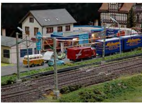
Fun for Kids & Families!