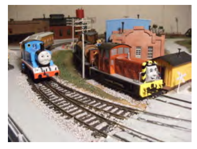
Brought to You by Our Outstanding FVD Crew!