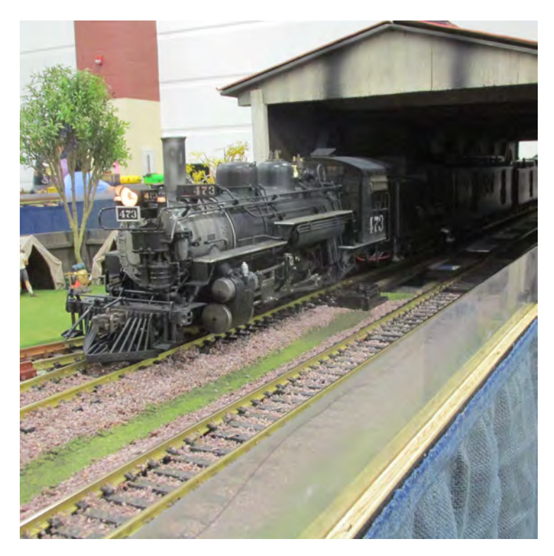
Matt Fierer's beautiful D&RGW K-28 exits the long covered bridge.

and transported by them. Trailers are used to store and transport the modules. Maintenance of the modules, locos, rolling stock, structures and scenery is handled individually by the members. Midwest Rails is an active modular group. It goes to 5 or 6 shows per year, has an annual meeting and also meets once or twice a year to work on the modules. It's all taken in stride by the members of the Midwest Rails Modular Group who have been going strong for more than 20 years with an appealing modular concept in one of the largest of scales. WH Layout photos by Walt Herrick.