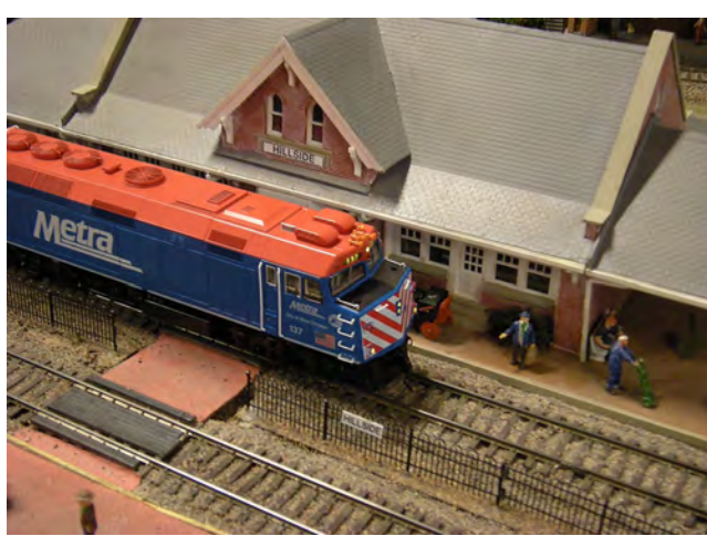
A Metra "Scoot" pulls into the brick station at Hillside