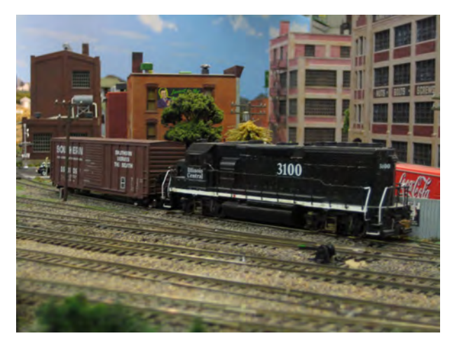
IC 3100 switches one of the many industries at Wallace.

The Hillside Yard locomotive facilities and caboose tracks are usually a beehive of activity on the KV&EC Club's HO model railroad. Almost all of the layout's locomotives and much of its rolling stock are owned by members which makes for a variety of neat equipment being run on operating nights. Annual member dues and a holiday season train set drawing at its large Holiday Display Layout in Sun City's Prairie View Lodge, finance new projects and cover the maintenance expenses on the club's four layouts.