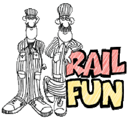
"3 1/2 days of trains for only $45 bucks for early registrants!"