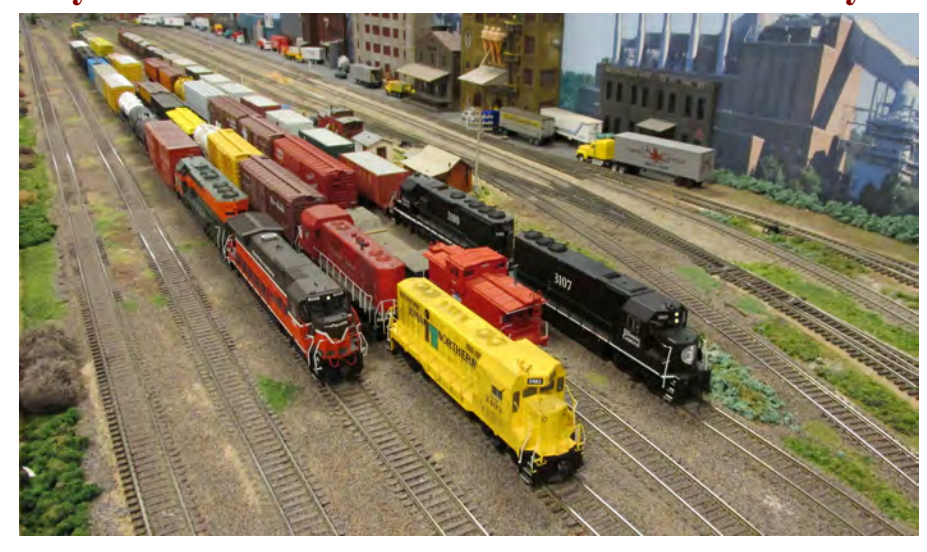
Two eastbound trains are ready to depart the east end of KV&EC's Nelson Yard this am while two other trains are switched.

Semaphore readers saw the Kishwaukee Valley & Eakin Creek's Club's huge G scale garden railroad in the September Semaphore. This month we'll take a look at the club's HO scale model railroad located in the basement of the Millgrove Workshop on Sun City Blvd. in Sun City Huntley. The HO railroad shares a large basement train room with the KV&EC club's hi-rail O scale layout and N scale layout. Also located in the basement are rest rooms, storage rooms, a work shop and separate Sun City Theater Company rooms. The HO and O scale layouts are fully operational and about 95% sceniced, and the N scale layout is partially operational and about half sceniced. All of the KV&EC layouts will be on tour the Friday night of Railfun 2014. WH