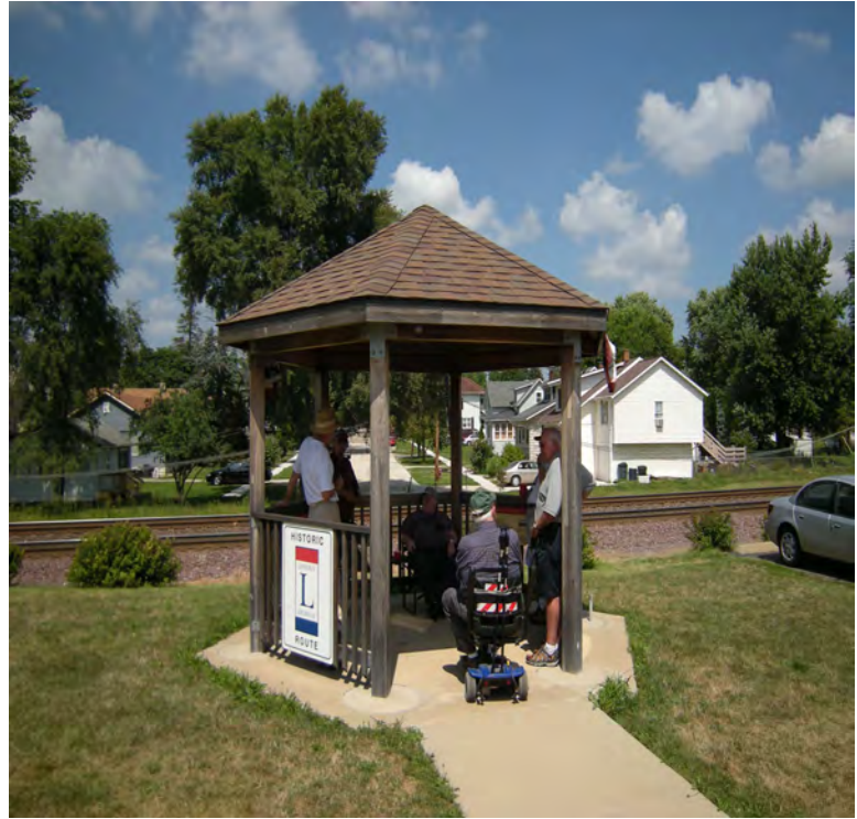
Rochelle Railroad Park's small gazebo turned out to be a perfect spot for an old fashioned bull session or two.