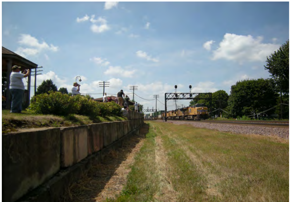
Train time! Photographers fire away at a hot east bound Union Pacific container train crossing Rochelle's famed double diamonds.