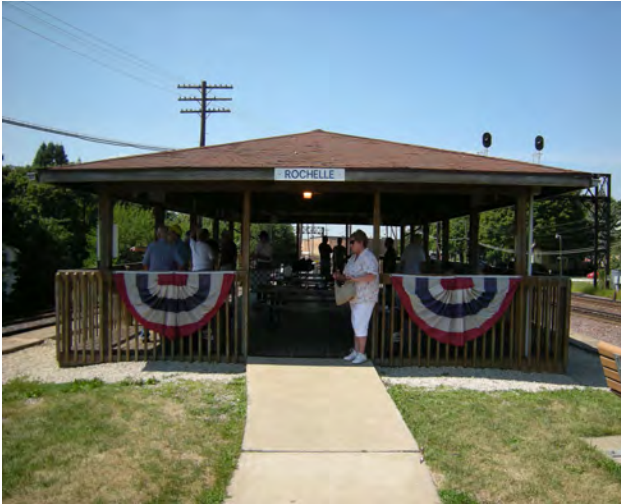
FVD members and their guests start to gather in the Rochelle Railroad Park pavilion for a day of train watching, good food and camaraderie.