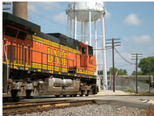
Picture perfect photo conditions prevailed at the FVD's recent Rochelle R.R. Park outing.