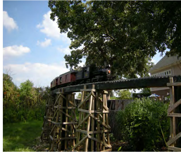
#12 leads its passenger consist over the high deck bridge near the west end of the KV&EC club's G gauge layout.