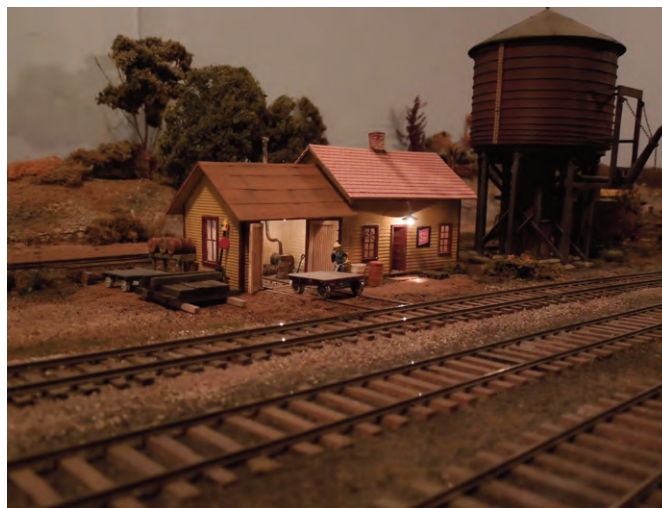
A scratch built MoW building with interior detail and lighting sits next to a scratch built water tank at Echo Lake. All of the trackwork is beautifully hand laid.