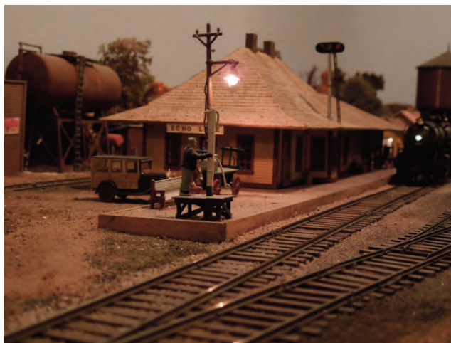
The Echo Lake station agent prepares for a mail drop. The Echo Lake depot is a scale model of a Soo class I depot most often found on the Minneapolis/St. Paul line.