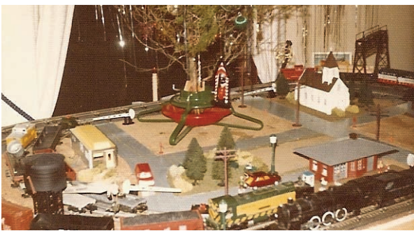
A 4 x 6 foot Flyer Christmas layout was built in Cincinnati in 1975. The layout became a year round fixture in my apartment's living room.