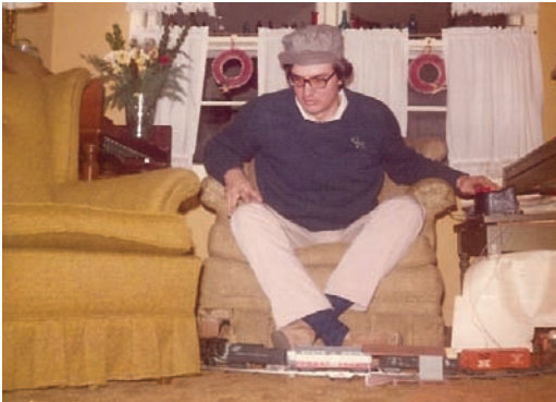
The American Flyer trains were resurrected from my parent's attic and set up on the floor just before Christmas Eve in 1974.

Since that Christmas in 1974, I've set up some kind of American Flyer layout for many Christmas's despite moving around the country a bit between 1977 and 1982. Only recently have I retired the AF trains. They were once again replaced by newer, more reliable HO trains (and slot cars) for the grand kids. The old scrap book photos in this article capture a few of the "Trains in my Christmas's." I'm sure some of you have similar photos of your old trains.