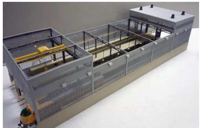
3rd Place Jim Landwehr's HO Scale Engine Repair Facility