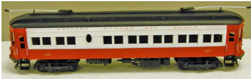
First Place: John Cloos for his O-scale CA&E Interurban Car

The September contest was for "Factory Fresh" painted models. There were 10 entries representing motive power and rolling stock and a variety of scales. Balloting was very close and needed to be resolved with a plea from Jim Osborn for more people to vote.