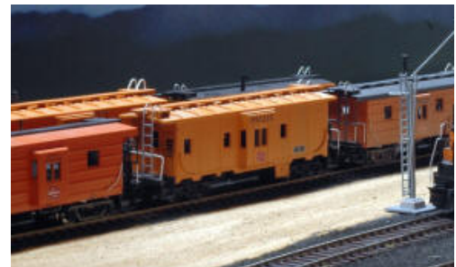
Tom Schweiss's Milwaukee Yard caboose track.

Bring in three to six of your favorite caboose and form a " Caboose Train " for December's contest. Your caboose may be any era, any color, or any scale—the contest is wide open except that you must have three to six of them! As usual, a popular vote of the members present at the meeting will determine our winners.