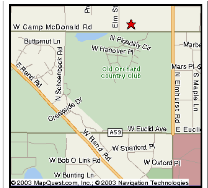
The Gary Morava Center, 110 Camp McDonald Road Prospect Heights, Illinois