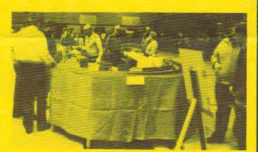
SCENE FROM HIGH WHEELER BB

We have had an ad in the NMRA Bulletin and also in the Daily Herald. Flyers have been distributed to hobby shops from Skokie to Schaumburg. We are anticipating a fine turnout.